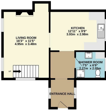
GROUND FLOOR 632 sq.ft. (58.7 sq.m.) approx.