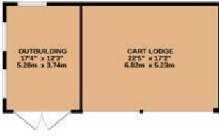
CART LODGE & WORKSHOP 688 sq.ft. (63.7 sq.m.) approx.