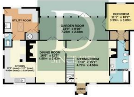
GROUNDFLOOR 1290 sq.ft. (119.5 sq.m.) approx.