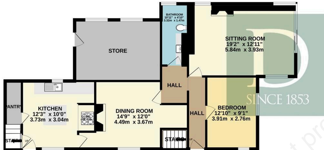
GROUND FLOOR 990 sq.ft. (92.0 sq.m.) approx.