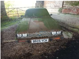
LOT 203 Capri Laser 2L