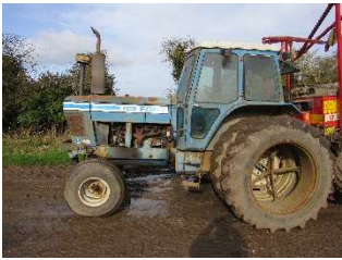
LOT 211 Ford 8100 2wd tractor with dual wheels (excludes the drill)