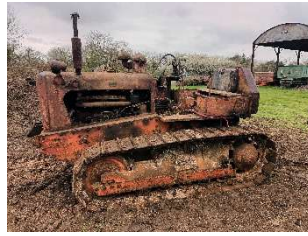
LOT 204 Fowler Challenger Crawler 22