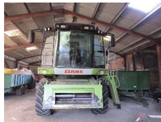
LOT 215 Lexion 520 Claas combine with V600 header

Further photographs are available on our website at www.durrants.com/machinery-auctions/next-machinery-auction