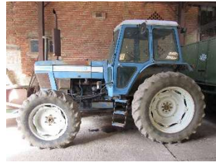
LOT 212 Ford 8200 4wd tractor