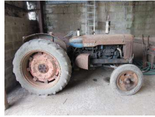
LOT 208 Fordson Major