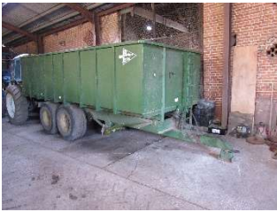
LOT 169 14T Brian Legg grain trailer, 1985