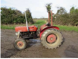
LOT 207 Massey Ferguson 135