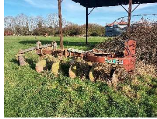
LOT 174 Opico 5f square plough