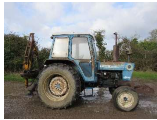
LOT 210 Ford 7600 2wd tractor