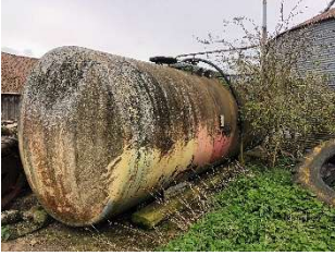
LOT 103 Scrap liquid fertiliser tank