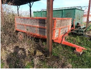
LOT 163 2 Wheel wooden tipping trailer