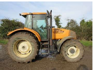
LOT 214 Renault Ares 696RZ Tractor