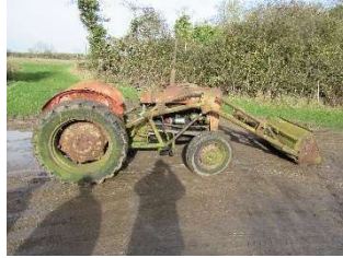
LOT 206 Massey Ferguson 35 complete with fore end loader