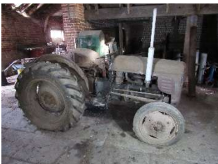
LOT 205 Ferguson tractor TEF 20