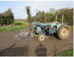
LOT 209 Ford 4000 2wd tractor