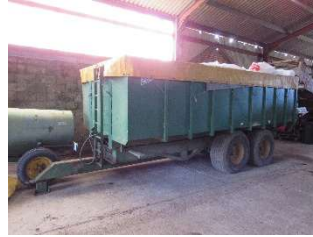
LOT 168 14T Brian Legg grain trailer, 1984