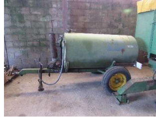
LOT 160 Legg Fuel Bowser