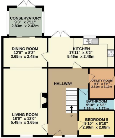
GROUND FLOOR 1149 sq.ft. (106.8 sq.m.) approx.